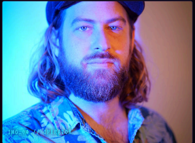
IMG_04 // OPERATOR