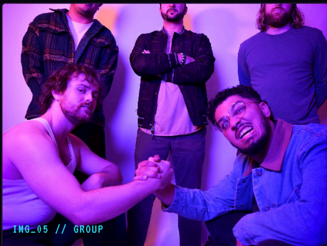
IMG_05 // GROUP