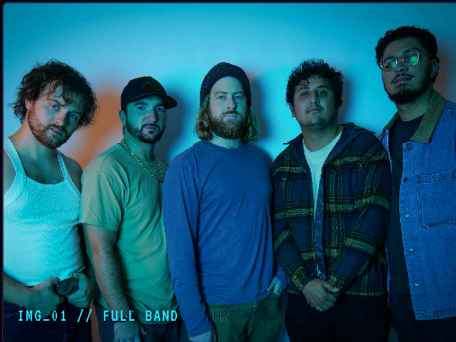
IMG_01 // FULL BAND