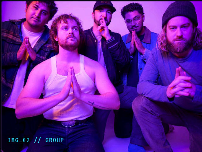
IMG_02 // GROUP