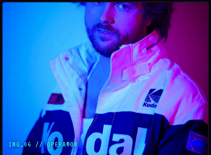
IMG_06 // OPERATOR